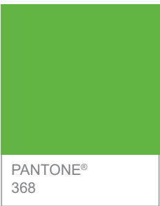
Rainbows Light Green CMYK 65-4-100-0 RGB 101-181-69 HEX # 65B545