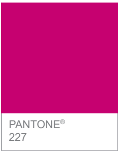
Rainbows Fuchsia CMYK 0-100-7-19 RGB 198-0-111 HEX # C6006F