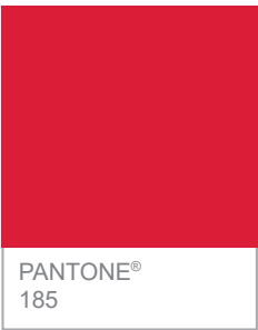
Rainbows Red CMYK 8-100-82-1 RGB 218-30-57 HEX # DA1E39