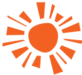
shining starts Infant/Toddler Services Sumner County