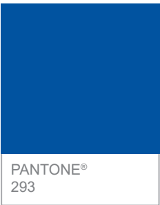
Rainbows Dark Blue CMYK 100-75-4-1 RGB 2-80-147 HEX # 025093