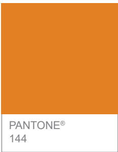
Rainbows Apricot CMYK 8-59-100-1 RGB 225-127-37 HEX # E17F25