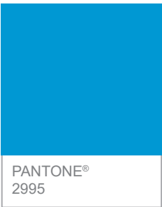
Rainbows Light Blue CMYK 88-21-4-0 RGB 0-152-209 HEX # 0098D1