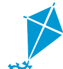
soaring above Specialized Foster Care