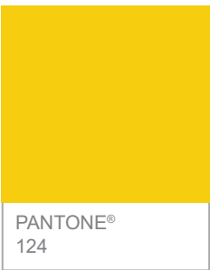
Rainbows Yellow CMYK 4-17-100-0 RGB 245-207-86 HEX # F5CF56