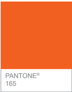
Rainbows Orange CMYK 0-77-100-0 RGB 242-97-34 HEX # F26122