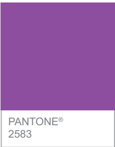
Rainbows Purple CMYK 50-82-00-00 RGB 142-79-159 HEX # 8E4F9F