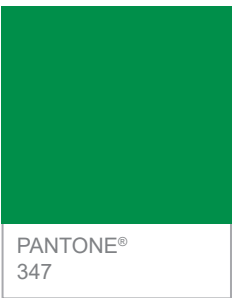
Rainbows Dark Green CMYK 100-16-100-4 RGB 0-142-74 HEX # 008E4A